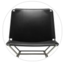
Black R900 Col. 02