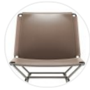
Turtledove R906 Col. 29